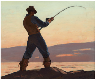
Gifford Beal Sea Bass Fisherman , 1940 Oil on board, 20 x 24 inches Anonymous Gift through the Westmoreland Society, 1995.51