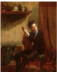
Joseph H. Boston Young Man with Violin , 1885–1886 Oil on canvas, 20 x 14 inches Gift of the Women's Committee, 1980.12