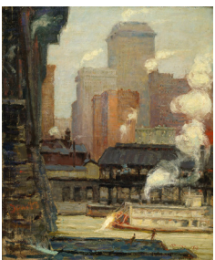
Arthur Watson Sparks (1870–1919) Bridge, Pittsburgh, Pennsylvania , 1912 Oil on canvas, 28 3/4 x 23 1/4 inches Museum Purchase, 1983.80