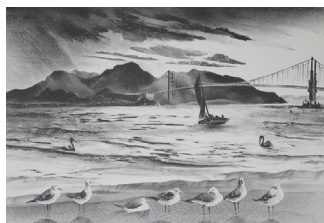
Adolf Arthur Dehn (1895–1968) Golden Gate Bridge , NO DATE Lithograph on Paper, 9 3/8 x 13 5/8 inches Director's Discretionary Fund, 1983.7